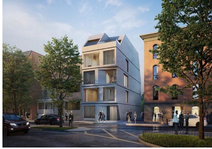
137 Carlton Avenue