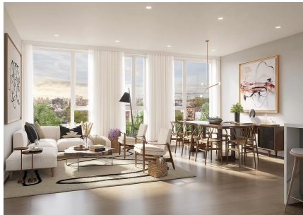
373 Prospect Place