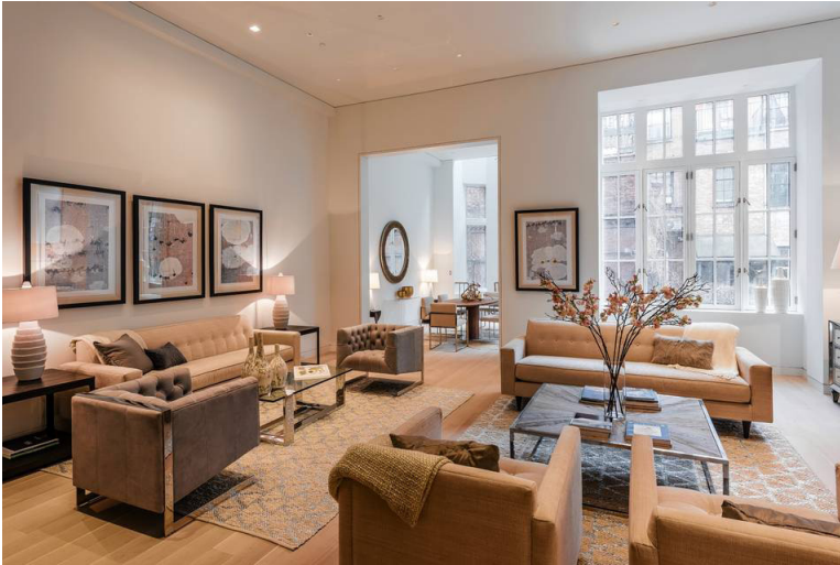
The five-story house has about 10,500 square feet of living space, plus a garden, terrace and roof deck.

In 1923, the women's group Pen and Brush purchased a Manhattan townhouse to serve as their headquarters for $52,000. Now the renovated house is on the market for $38.5 million.