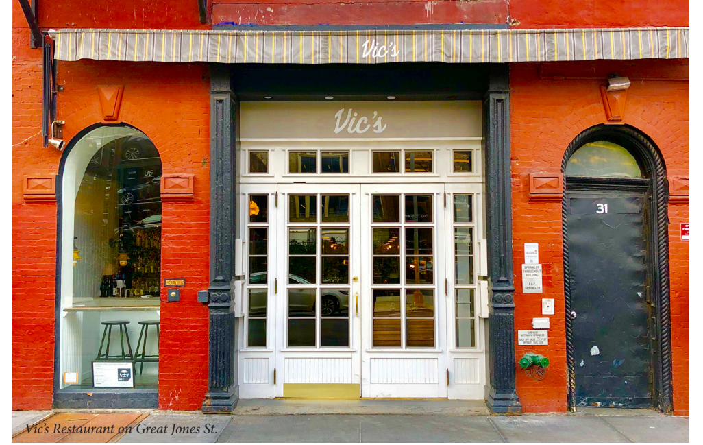
Vic's Restaurant on Great Jones St.

The neighborhood also provides a liberating shopping experience with designer boutiques to fill your afternoons. Some of my favorite boutiques are SSUR (296 Elizabeth Street) for some trendy streetwear, C'HC'M (2 Bond Street) featuring classic clothing, shoes, and jewelry sourced from designers around the world. There's also C.C. Filson (40 Great Jones Street) specializing in outdoor clothing, accessories and luggage. For the trendiest fashion looks head to Oak (28 Bond Street) where you'll find the chicest finds for both men and women. Shopping in NoHo is sure to put you at the forefront of fashion and give you a certain je ne sais quoi .