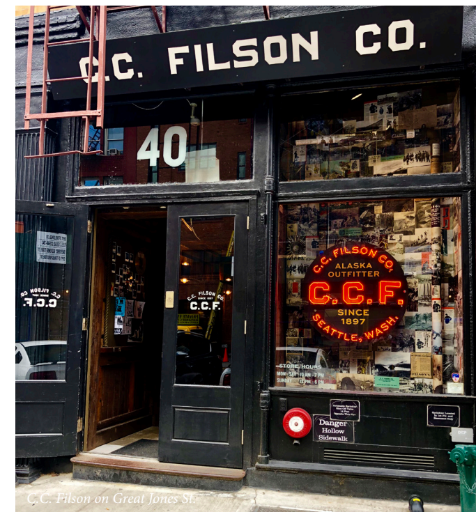
C.C. Filson on Great Jones St.