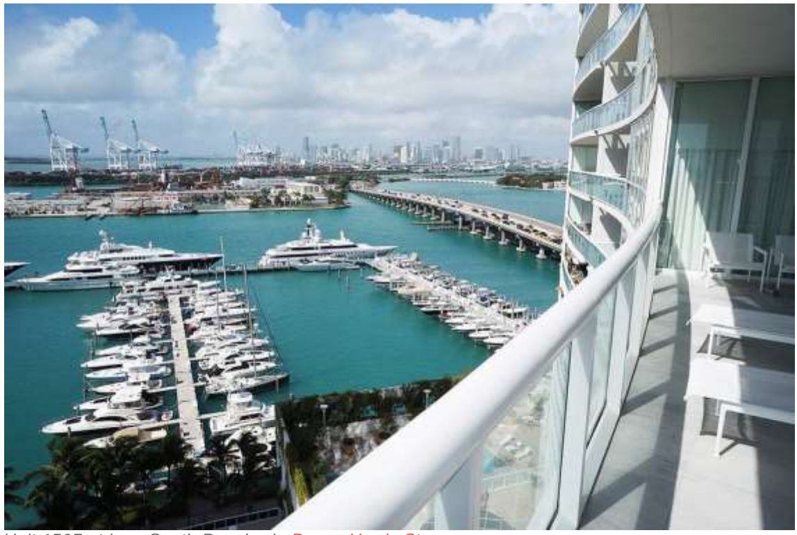
Unit 1507 at Icon South Beach

A corner residence at Icon South Beach with two bedrooms and two bathrooms sold for $2.2 million ($1,212 per square foot) last week after listing for $2.36 million in August.