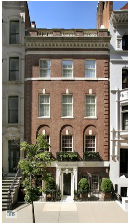
BrownHarrisStevens.com WEB# 14726886

GENERALLY 59TH TO 96TH STREET, FIFTH AVENUE TO THE EAST RIVER