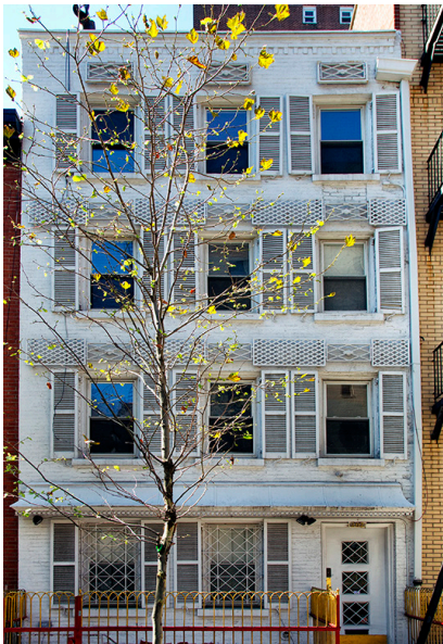
BrownHarrisStevens.com WEB# 11122180