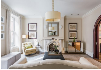
BrownHarrisStevens.com WEB# 14583220