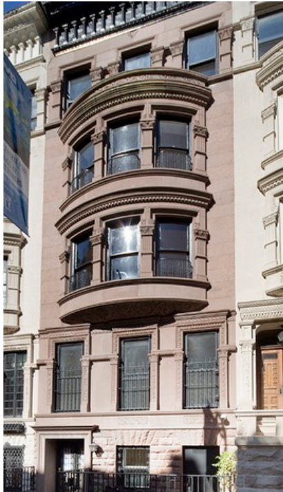
BrownHarrisStevens.com WEB# 9106891

GENERALLY 59TH TO 96TH STREET, FIFTH AVENUE TO THE EAST RIVER