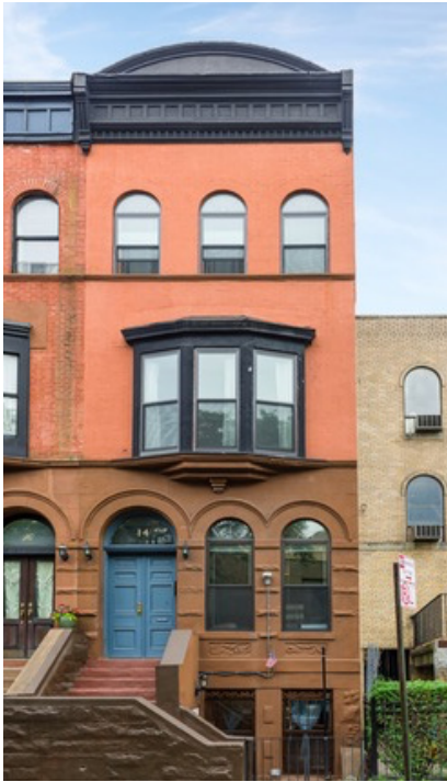
BrownHarrisStevens.com WEB# 16727586

GENERALLY NORTH OF 96TH STREET ON THE EAST SIDE, AND 110TH STREET ON THE WEST SIDE