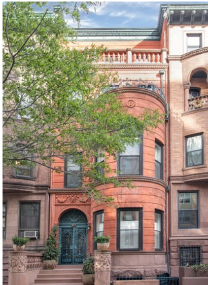
BrownHarrisStevens.com WEB# 14299611

GENERALLY 59TH TO 110TH STREET, HUDSON RIVER TO WEST OF FIFTH AVENUE