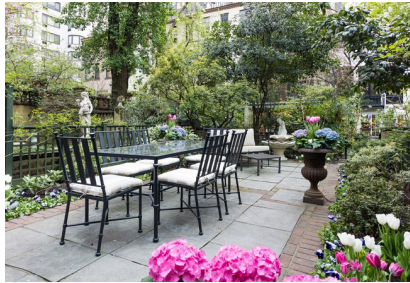
BrownHarrisStevens.com WEB# 16659385