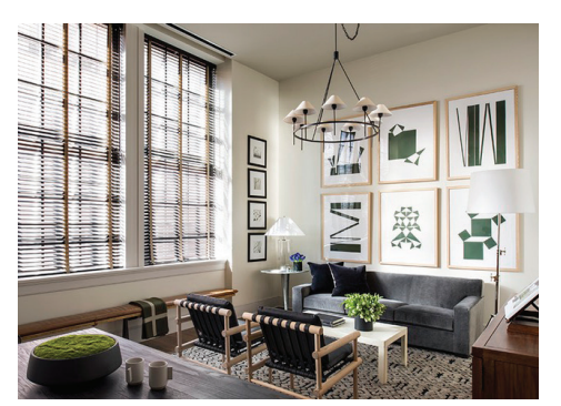
BrownHarrisStevens.com WEB# 16632933