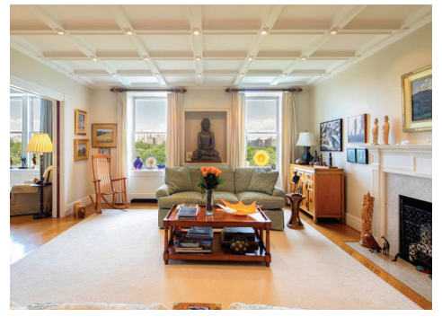
BrownHarrisStevens.com WEB# 17103900

GENERALLY 59TH STREET TO 96TH STREET, FIFTH AVENUE TO THE EAST RIVER