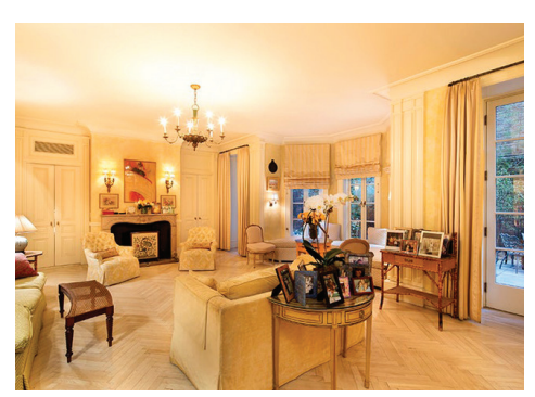
BrownHarrisStevens.com WEB# 14766222