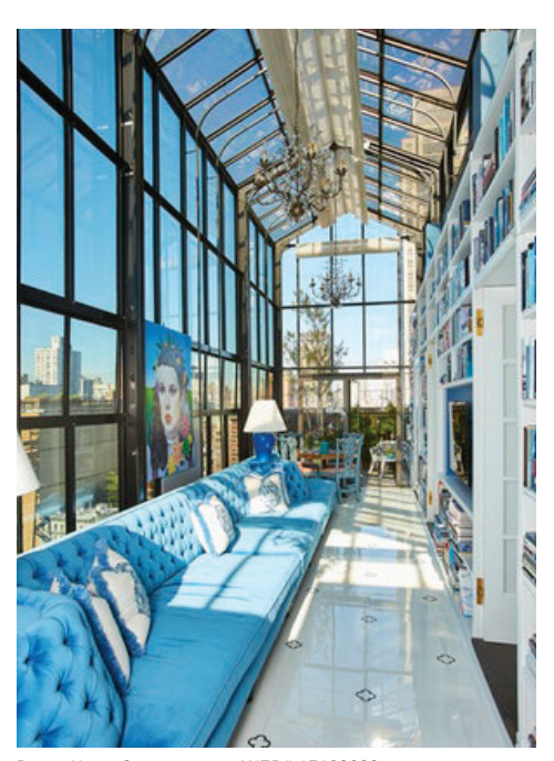
BrownHarrisStevens.com WEB# 17639322