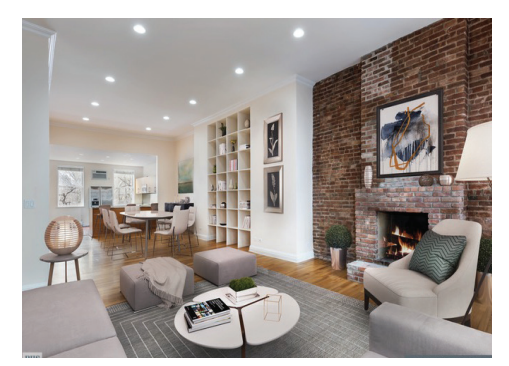
BrownHarrisStevens.com WEB# 16839238