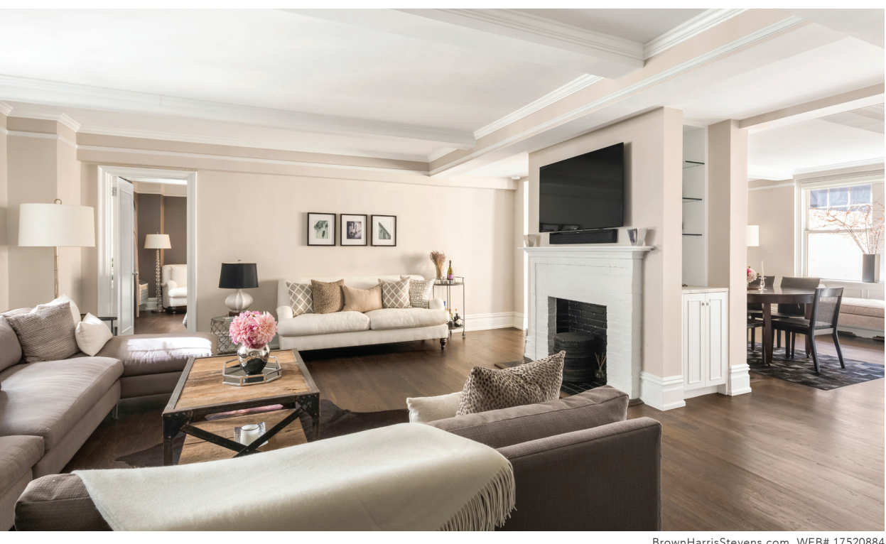
BrownHarrisStevens.com WEB# 17520884

Upper Manhattan's absorption rate of 4.2months was Manhattan's lowest.