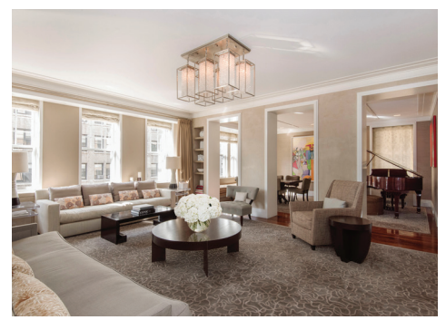
BrownHarrisStevens.com WEB# 17423088