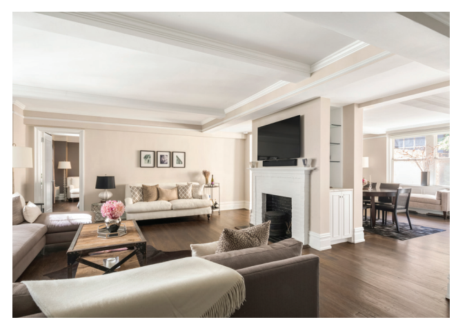
BrownHarrisStevens.com WEB# 17520884