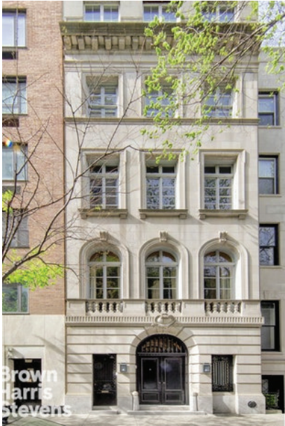
BrownHarrisStevens.com WEB# 18487854

Generally 59th to 96th Street, Fifth Avenue to the East River